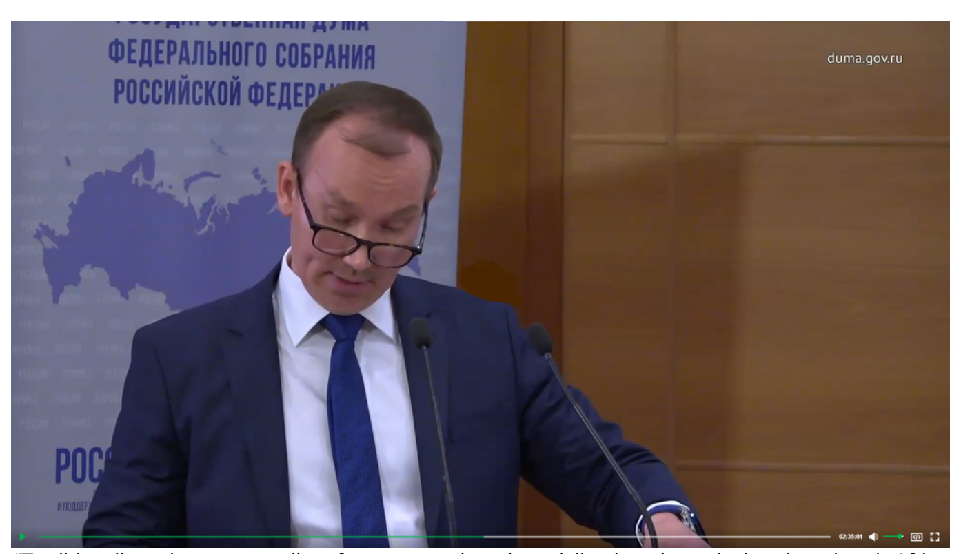
"Traditionally acting as a supplier of unprocessed products (oil, minerals, agricultural products), Africa today pays special attention to the transformation of the economy from extractive to industrial. The key factors of this transformation are the training of highly qualified personnel and the development