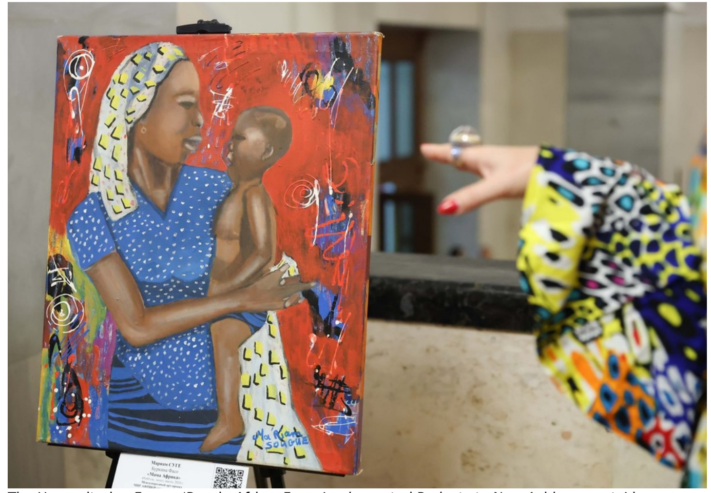
The Humanitarian Forum 'Russia-Africa: From Implemented Projects to New Achievements' is designed to summarise the results of the implemented projects and promote further cooperation and mutual understanding between Russia and African states in the fields of culture, education, information, sports, social projects, diaspora partnership and women's agenda.