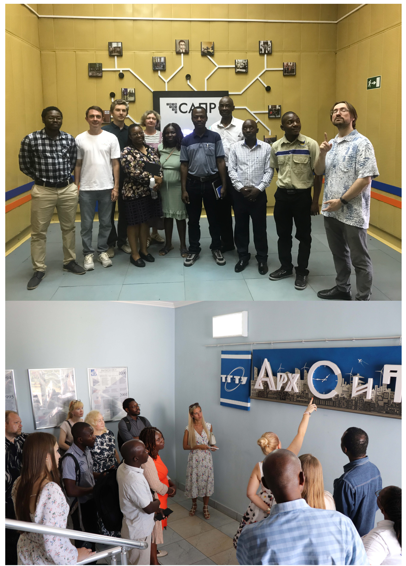
The students also had an excursion educational and cultural programme 'The History of the